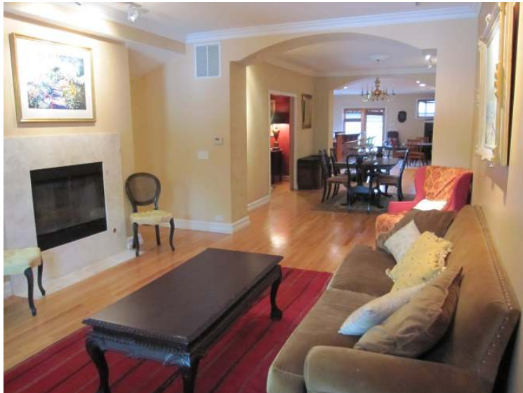
Kitchen/Living Room/Dining Room/Patio on 1 st Level

Rates starting at: $9500/month (only monthly) – Pets Possible (inquire)